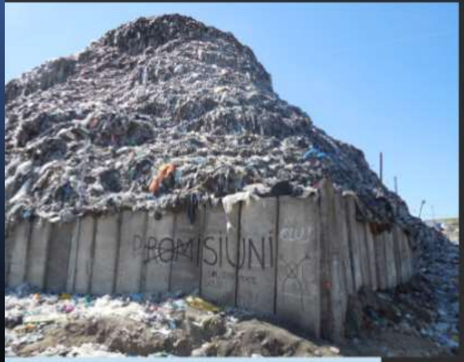
Pile of waste in Pata Rat, Cluj, Romania